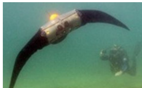
The bionic autonomous robot platform "Manta"

Network: All sensors are integrated into a network. The backbone is a CAN-Bus integrated into the textile skin. At defined positions receptacles with multi-pin-connectors are provided in the bus. Sensor modules with the complementary connectors were inserted into the receptacles and through the pins electrically connected to the bus. The receptacles were then closed with a lid and flooded with a protective oil. The construction allows a shift exchange of sensor modules, e.g. for different mission profiles. Textile sensors were fed into the connecting receptacles. Data acquisition and processing takes place in the sensor modules.