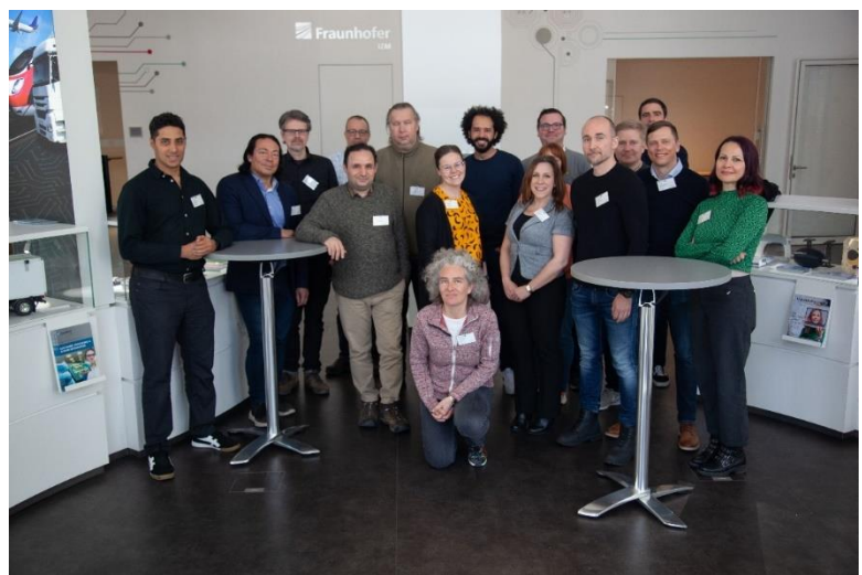
The Newlife consortium gathered at Fraunhofer IZM in Berlin in spring. I © Fraunhofer IZM I Print quality: <a href="https://www.izm.fraunhofer.de/pics">www.izm.fraunhofer.de/pics</a>