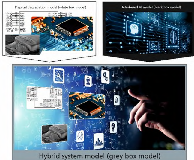
Fig. 1 Hybrid models combine the advantages of both physical and data-driven models.